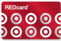
Target debit & credit cards

Shop at www.escrip.com or sign up your Safeway and credit cards with eScrip. % of your purchase goes directly to Kaiser PTA. Every year you need to designate Kaiser Elementary School PTA, Oakland, CA as the beneficiary. ( ID: 139262109 )